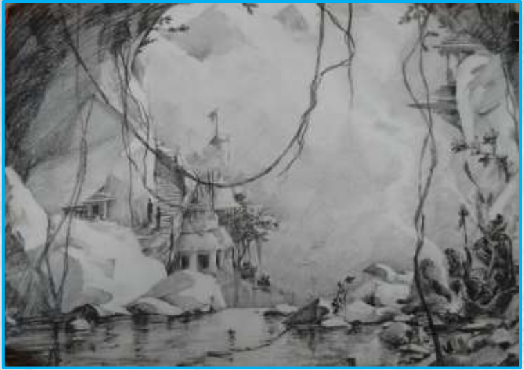
Abhilash Jagtap, B.Arch