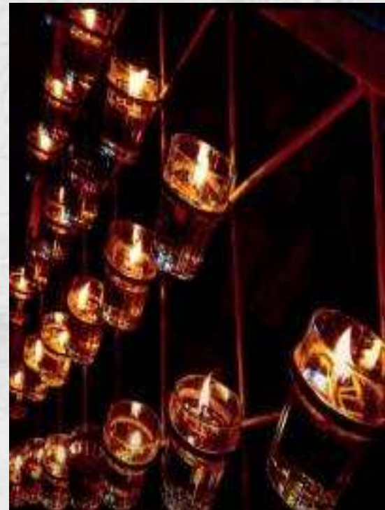
Balbhim Kulkarni (Alumni, EE)