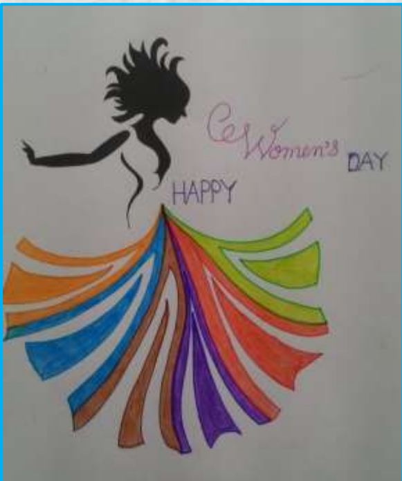
Shweta Motaphale S.Y MCA