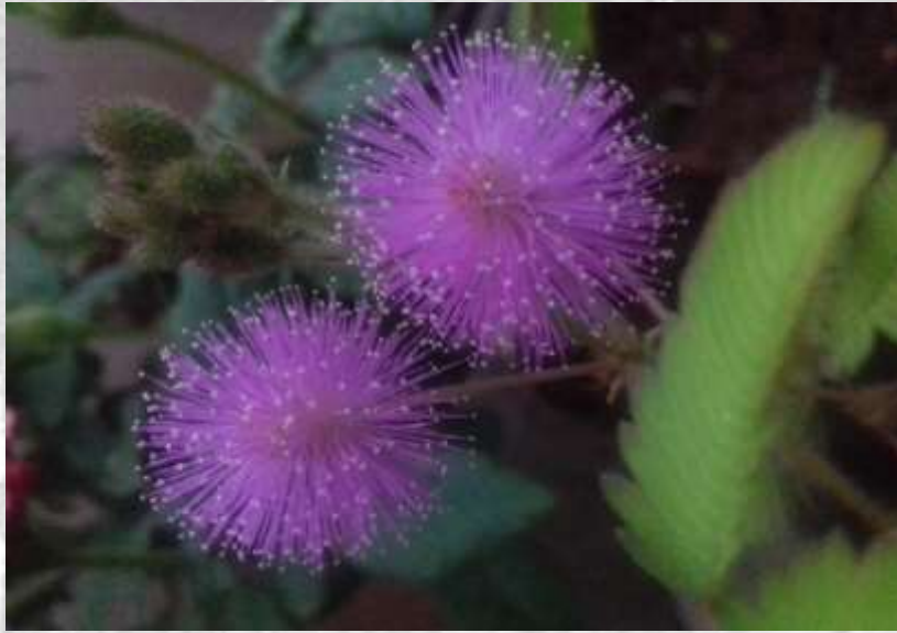
Veena Bhirud, TE (Engg.)